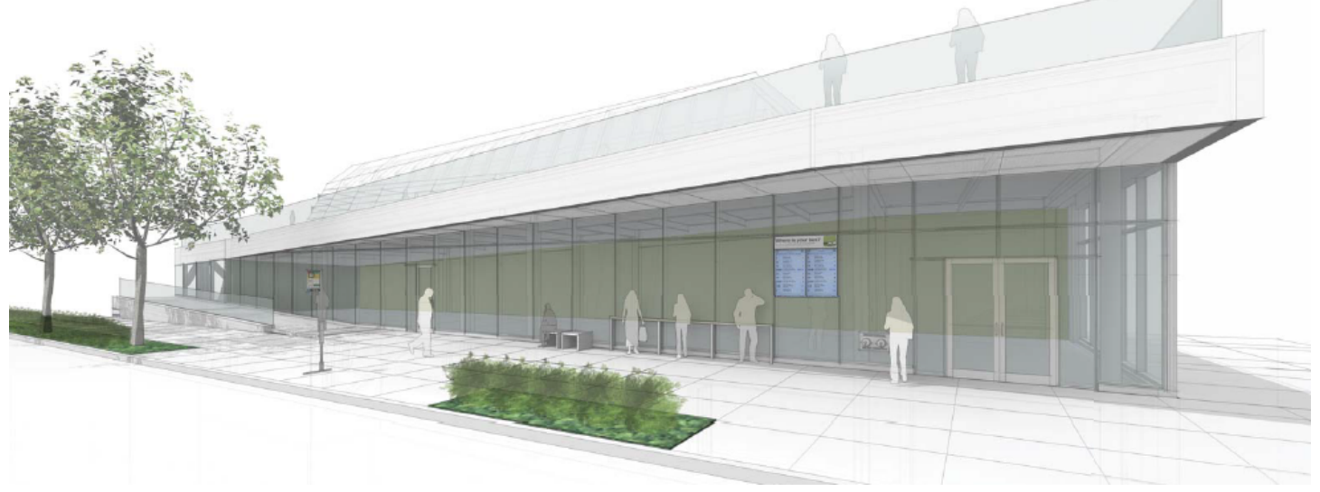
View looking northwest at the bus shelter / transit hub in front of the southeast shell space.