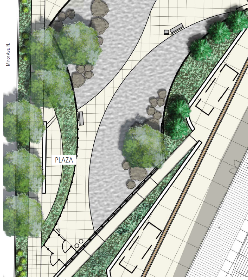
Enlarged plan view of the open space plaza and off-leash area.

Note that the comments listed above do not address the CIP project design, including color, materiality, and other outstanding concerns from the Commission's schematic design review in April 2014.